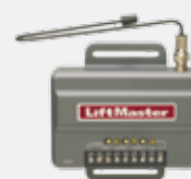
Universal Receiver (850LM/860LM)

64 in. in-ground mount pedestal, 2 x 2 in. square pipe with a black powder-coated finish, 11-gauge steel.