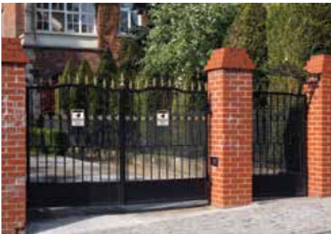
Entrances with Electronic Locks Requires Universal Receiver