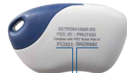
Facility code (FC)= 001 Serial Number (SN)= 28886