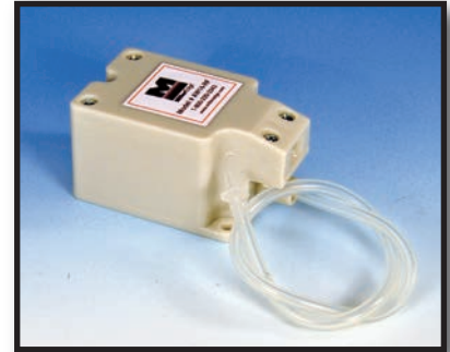
AW14-RF : AW-10 Switch complete with a transmitter in a Molded Enclosure