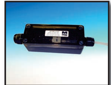
AW-12 Switch in NEMA 4x Enclosure

NEMA Rating: 4x Enclosure Material: Polycarbonate Tubing: Silicone, 1 Ft. x 3/32" I.D. Pneumatic Connection: Barbed Coupler 3/32" I.D.