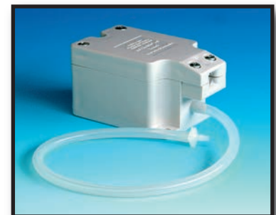
AW-14 : AW-10 Switch in a Molded Enclosure

NEMA Rating: 4x Enclosure Material: Polycarbonate Tubing: Silicone, 1 Ft. x 3/32" I.D. Pneumatic Connection: Barbed Coupler 3/32" I.D.