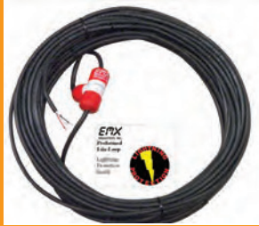
PR-XX (lite preformed loop with lightning protection)