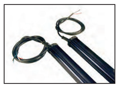
Receiver (left) Emitter (right)